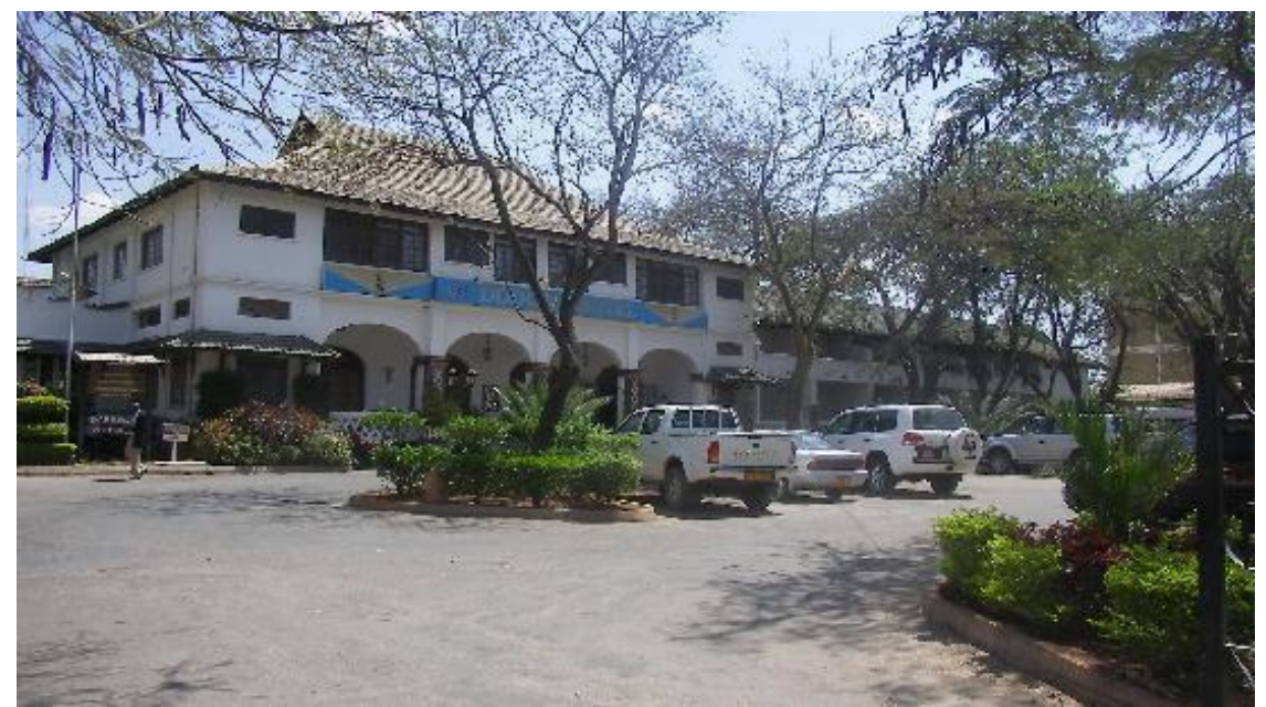
Same Dodoma Hotel – Recent. The old splendour and elegance is no longer there.