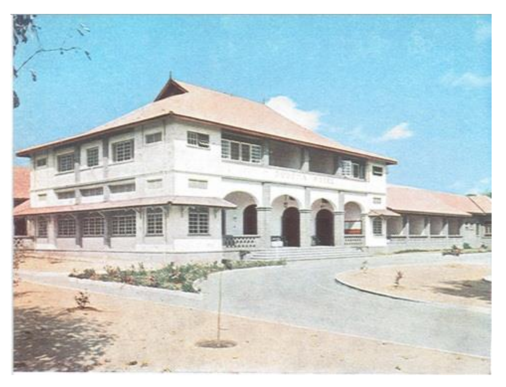
Dodoma Hotel - Tanganyika 1950's